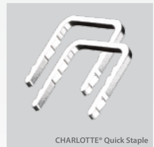
CHARLOTTE® Quick Staple