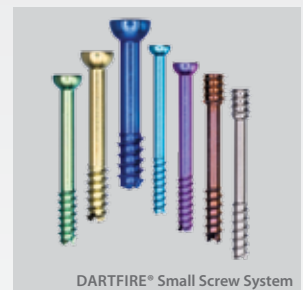
DARTFIRE® Small Screw System