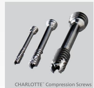
CHARLOTTE™ Compression Screws